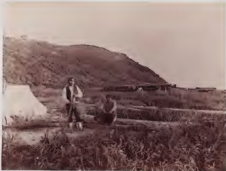
Fish Drying Frames. near Fort Alexander Mouth of Nushegak River